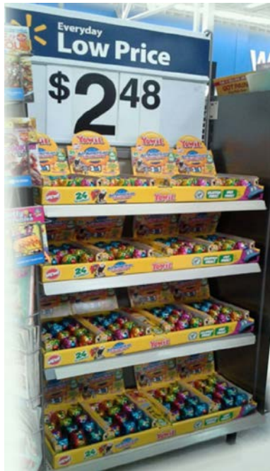
'All American Series' in store display